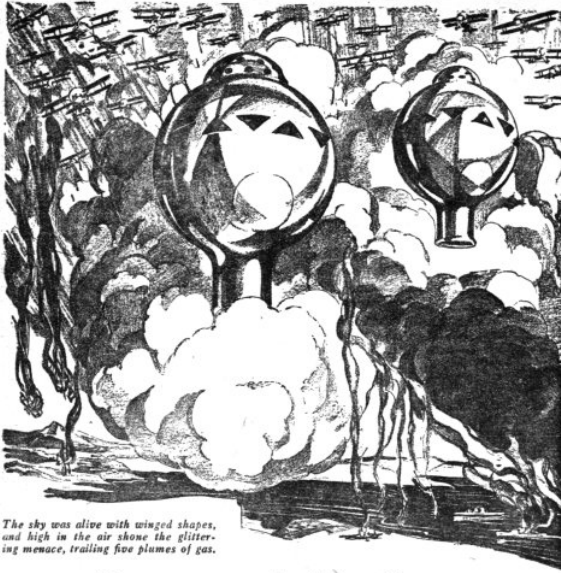
The sky was alive with winged shapes, and high in the air shone the glittering menace, trailing fine plumes of gas.